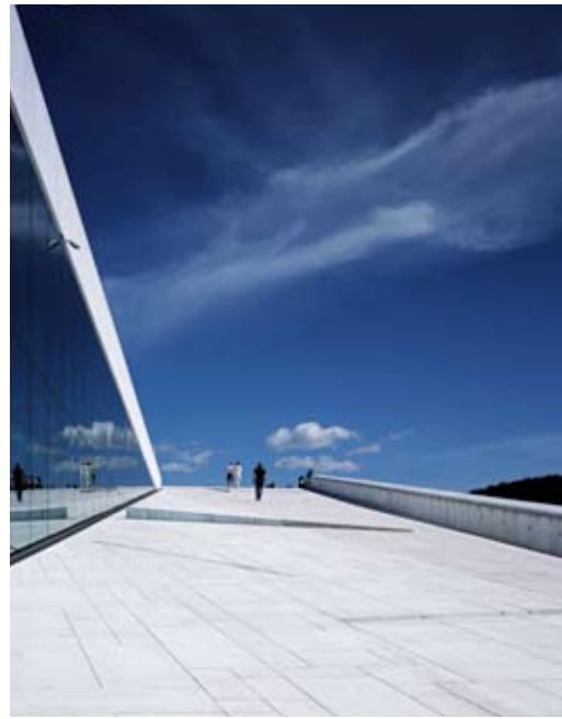
Oslo Operahouse, Norway

international organisations national and local governments public boards and institutions commercial groups private clients Snøhetta works together with the client to tailor make a suitable organisation for each project.