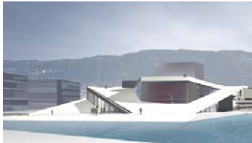
Oslo Operahouse, Norway