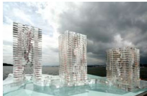
High Rise in Amsterdam - model photo