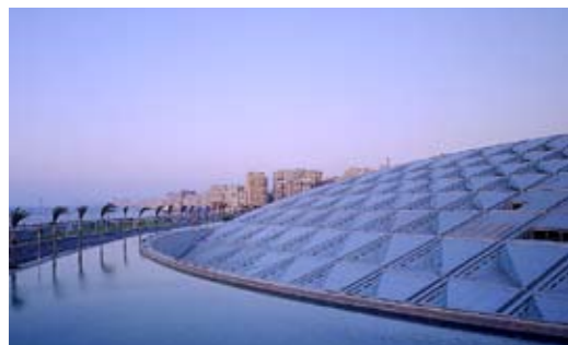
Alexandrina Library, , Egypt